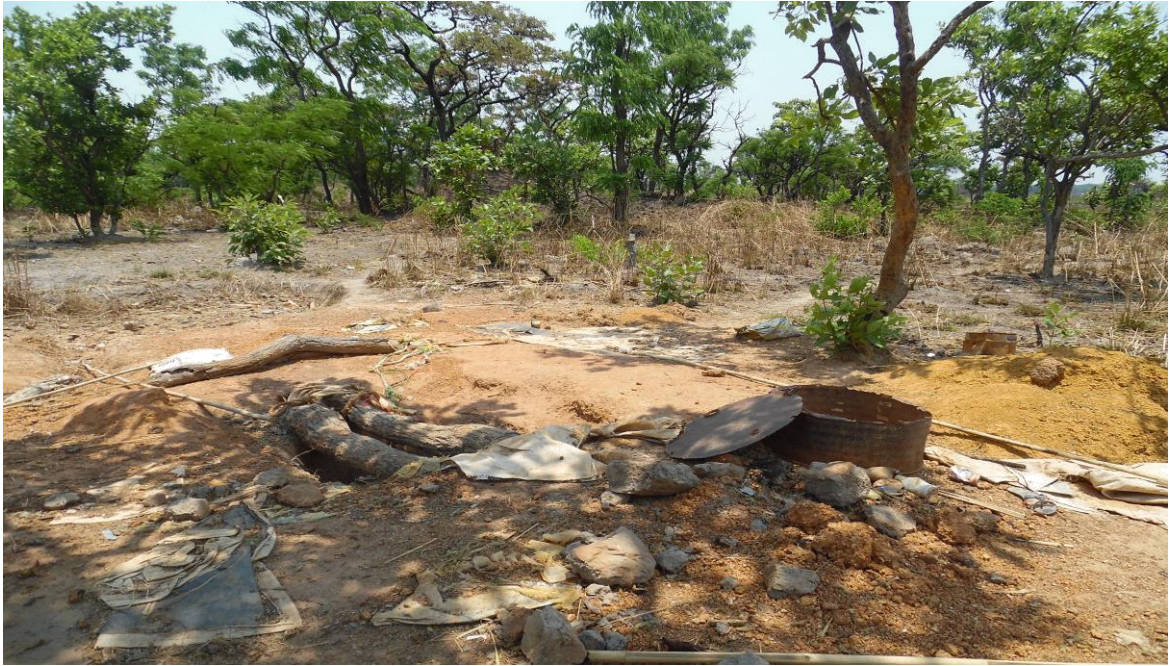
5: Despite the efforts of the community, wells remains hopeless dry