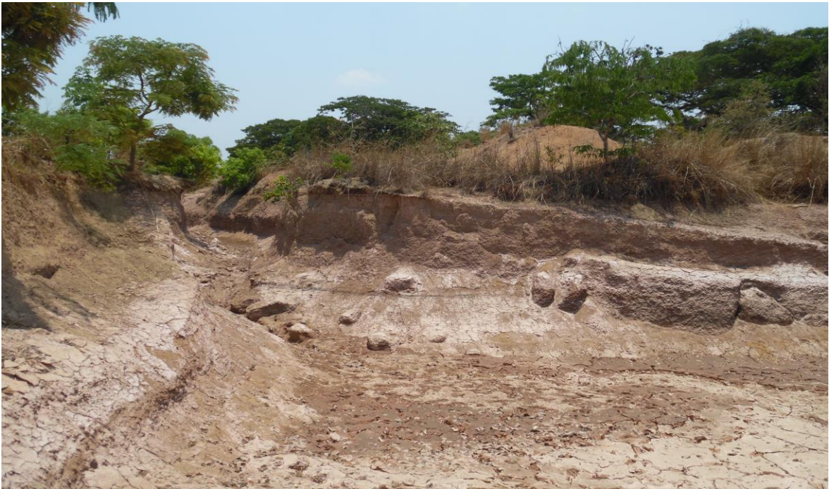
3: The riverbed of the Mabende river

to take the necessary measures to preserve their living space and to put in place mechanisms that could ensure the benefit of the economic profits of this investment.