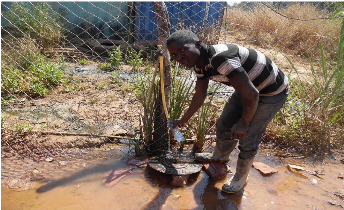
4: The only spot of water in Mabende that unfit for human consumption