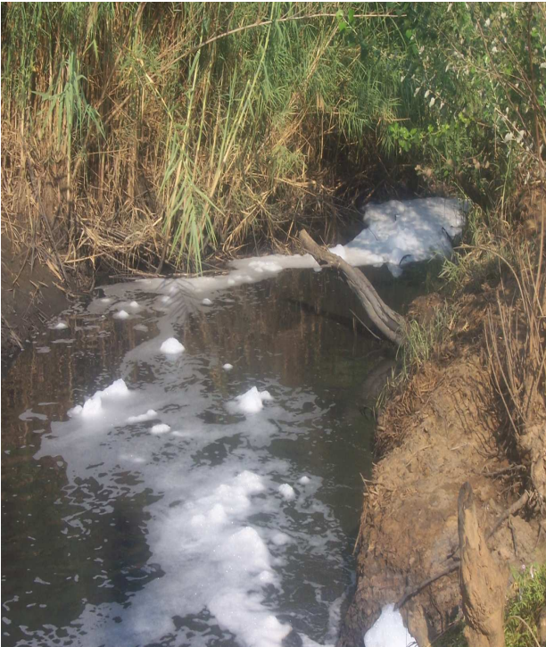
Figure 8: KAFUBU pollution by the mining activity