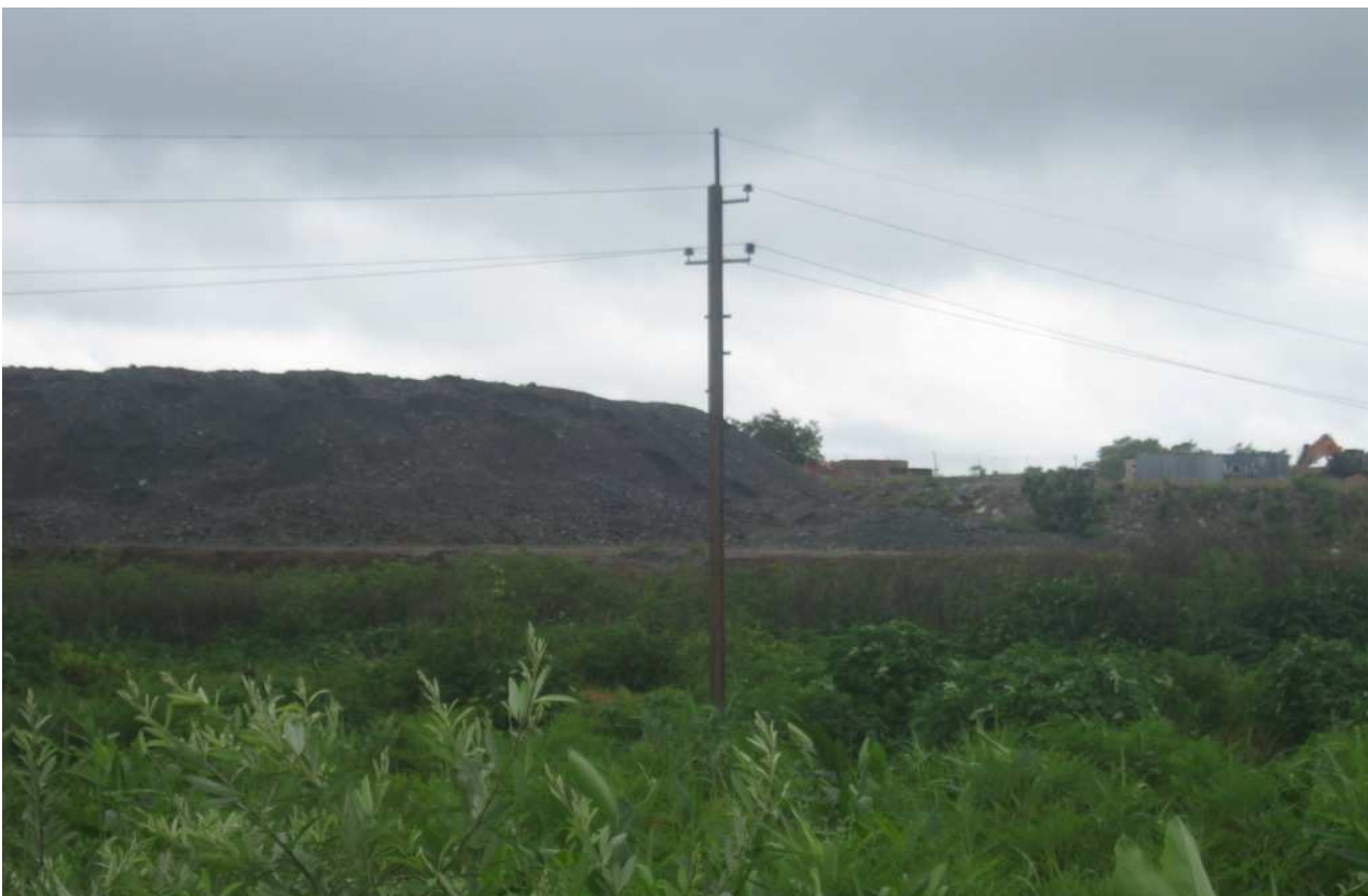
Figure 7: A view on CMSK installation at LUSWICHI

It should be specified that the monitoring conducted in this survey was done before September 25 th , 2012. It is related to CMSK company in its original shape.