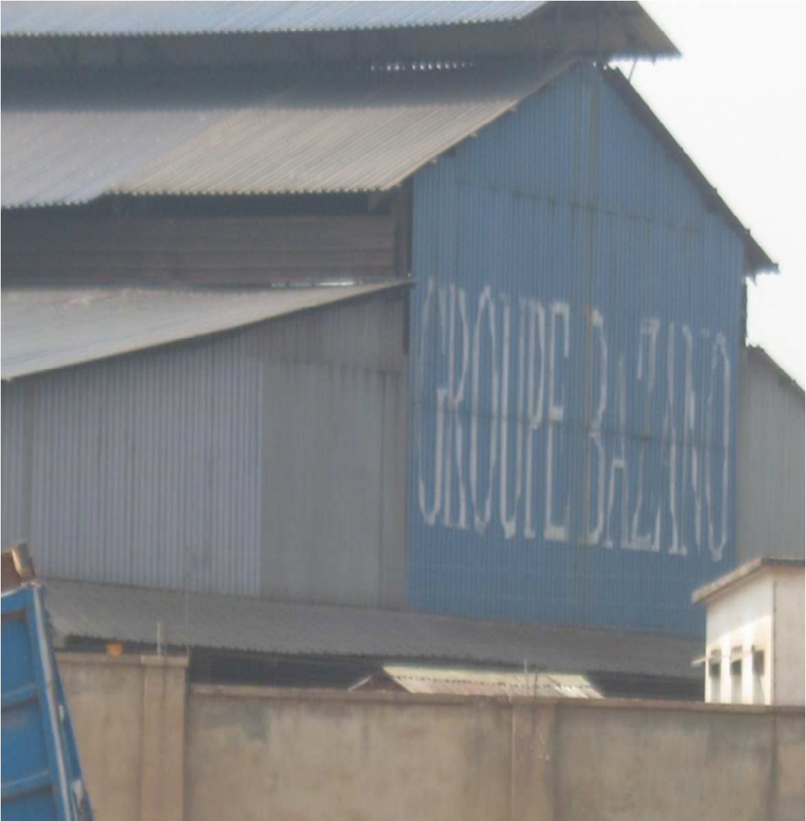
Figure 1: GB, LIKASI foundry

This plan, (PDD) is made according to the consultations that the company must organize with the residing populations before the project start. The PDD domains are already defined by the mining legislation: health, education, infrastructures and production. In the following lines, we notice how GB and CMSK comply with these dispositions.