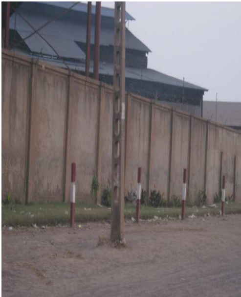
Figure 2: In time, a slag has been absorbed by the ground