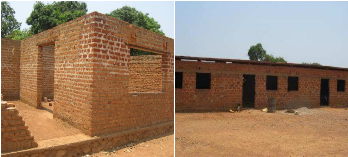
Figure 12: A KAWAMA village, chief house site since 2005, and unfinished school...