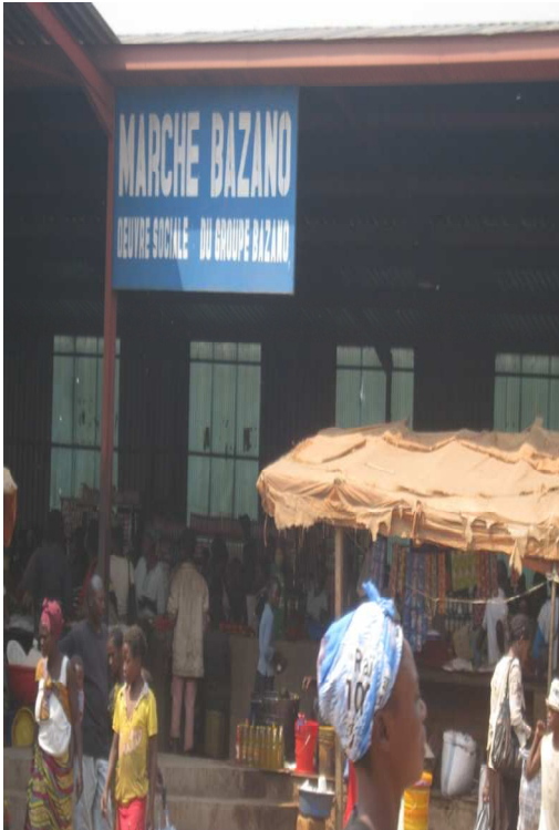
Figure 6: BAZANO market at LIKASI