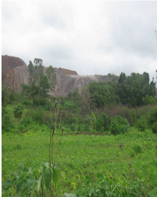
Figure 11: LUSWICHI source below a CMSK embankment